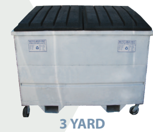
Approximate size = 6'x4'x4' Maximum weight = 500 lbs